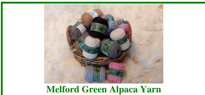
Melford Green Alpaca Yarn

On the last Saturday before Christmas Bob & Bert were once again invited to Jimmy's Farm on the outskirts of Ipswich, (as featured in the BBC TV series). The massive turn out for the Christmas Farmers Market (around 3 thousand cars) meant that they received loads of attention and fuss. As usual they rose to the occasion and behaved with great decorum. Meanwhile, dressed in Santa Claus hats and in between explaining "No they're not llamas, they are alpacas" or "No they won't spit;" we managed to sell loads of our Suffolk spun alpaca yarn.